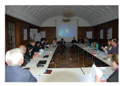
Workshop participants, conference hall ZMO

The aim of the workshop was to explore the shifting meaning of regional belonging across the neighbouring regions of South