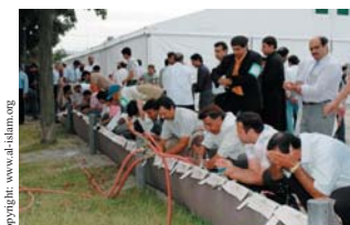
Ahmadis performing their purification act at a meeting in Germany

Collaborative project at the Centre for Modern Oriental Studies and the Universities of Frankfurt/Oder, Halle/Saale and Hamburg, 2006-2009. Funded by the German Federal Ministry of Education and Research under the Grant Programme "Humanities in Dialogue with Society".