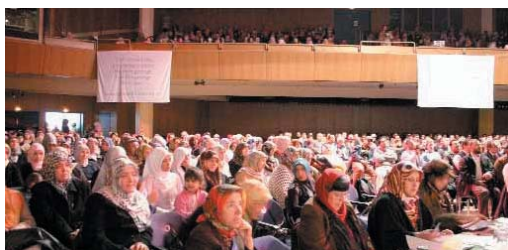
Islamic Community Milli Görüş (IGMG), Meeting of Women

The project analyses religiously authorised gender discourses in the Islamic milieu in Germany, concentrating on female and male actors in the Turkish-Islamic organisation Milli Görüş. By combining data gathered in Germany with gender discourses and practices in the Islamic context, the project attempts to provide a transnational research perspective. It thus analyses the dynamics of Islam in Europe under the aspect of continuities and discontinuities Islamic traditions might experience as a result of lasting Muslim presence in the European context.