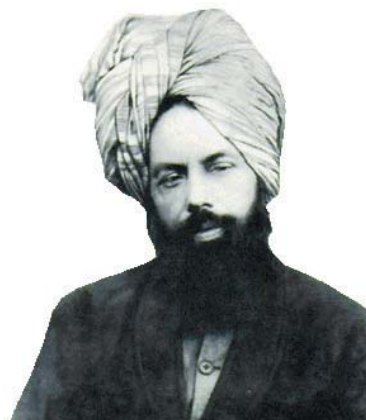
Hazrat Mirza Ghulam Ahmad, founder of the Ahmadiya

The core of this project is the Islamic reformist movement of the Ahmadiya in Germany. It originated in South Asia, where it was founded by Hazrat Mirza Ghulam Ahmad at the end of the 19th century. Based on the analysis of material published by and about the Ahmadiya, the first research phase deals with its image in German society in general and the German media in particular. Its perception of Germany's attitude to the movement will be discussed in retrospect, as will its relationship to pluralism and the secular environment. Finally, a comparison with the movement in Great Britain, India and Pakistan will be undertaken in the context of the above-mentioned issues, which will include legal and interreligious aspects, as well as the approach of the countries concerned to Islamic minorities.