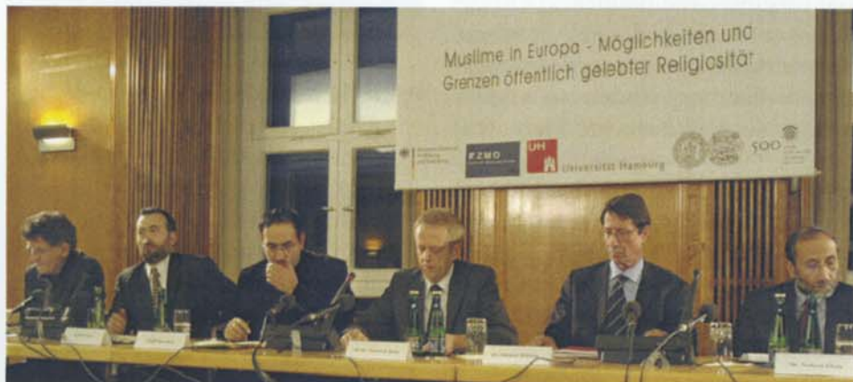
Participants of the panel discussing issues of Muslims in Germany