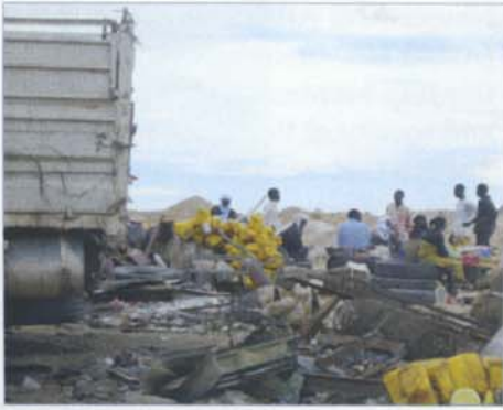
Migrants in the desert

Algeria, the second largest country in Africa, is now recording very positive macroeconomic data due to the high price of oil. Profits accumulated during the period of political crises are being used to reconstruct and modernise the country's infrastructure, with Chinese companies playing an ever more important role. Algeria's building sector is increasingly dominated by Chinese companies that are recruiting Africans en route to Europe to work on their construction sites.