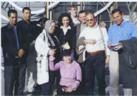
Participants in the workshop