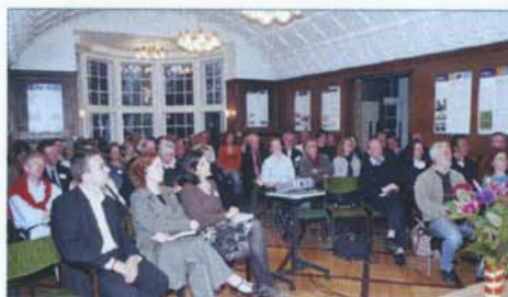
Guests at the award ceremony