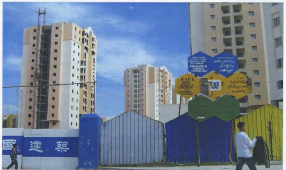
Chinese building site in Algiers

businessmen and Algerian government ministries more closely. China has established itself as an influential political and economic actor in Algeria; unlike many Western economic actors, China treats Algeria seriously as an economic partner, taking it into account in the exchange of interests and aiming for a 'win-win' situation – not distinguishing, as is usually the case, between resource and development policies. Chinese companies often invest in areas and regions that Western firms have abandoned or decided are not very attractive, and build streets, dams, airports and new housing projects – to name only some examples. On signing a trade contract, Chinese businesses ensure that they will realize most of the infrastructure Algeria needs – as a way of insuring that investments will not go bad. That way, streets and airports really get financed and constructed, and local staff gets schooled – faster and cheaper than would have been possible with Western partners. At least in economic respects, and for