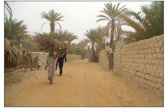
Faya palm-grove, Northern Chad, 2012

Having carried out long-term ethnographic fieldwork in a number of different Saharan field-sites – in Algeria, Mali and Chad – since 2007, my research project at the ZMO aims to pull my prior findings together, to enrich them with a careful study of local archival materials and secondary sources produced on other areas in the Sahara, and, ultimately,