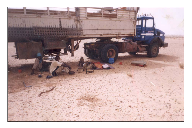
Trans-Saharan Truck in Northern Mali, 2008

The video went viral; its author was feted as a heroine; demonstrators took to the streets in various European and sub-Saharan African capitals; related matters were debated at the UN security council. Few inquiries were made, however, into the »slavery« that had been por-