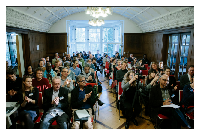
The ZMO conference hall - a worthy frame for the conference

In panel discussion six on transitional justice, Susanne Buckley-Zistel analysed the trends in the creation of memorials to