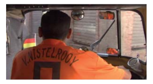
Toktok driver in northern Egypt with German flags and a Dutch jersey. Video still from »Messages from Paradise #1« by Daniela Swarowsky and Samuli Schielke, 2009

parts of the two opposing blocs (socialism versus capitalism) during this period play in the formulation of Islam as a distinct political system and an alternative to those societal models? Further, what were the political and economic conditions of production of the Arabic-language media of these debates, and how were they connected with other local, national or transregional media (books, radio, television)?