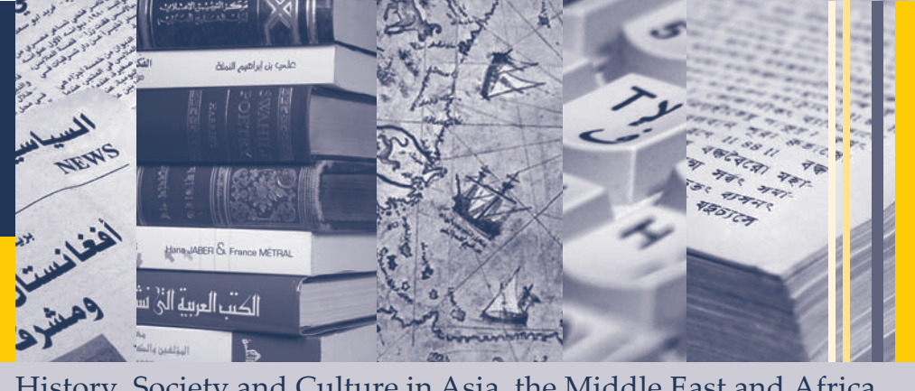
History, Society and Culture in Asia, the Middle East and Africa