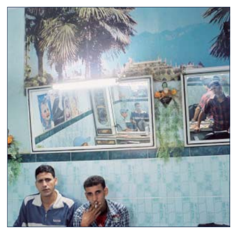
A barber shop in a village in northern Egypt