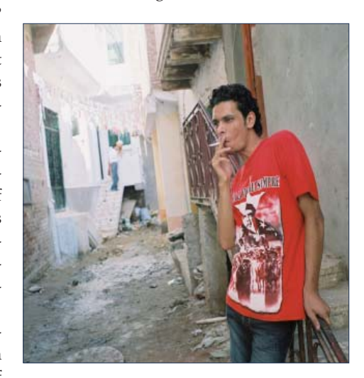
A young man with a Che Guevara T-shirt in northern Egypt

ond step, the dissertation seeks to examine the extent to which Ottoman travellers deemed themselves able to learn something from these new Balkan states about their perceived progress towards the standards of metropolitan Europe. Therefore, the goal is to shed light on the networks of relations among the Ottoman Empire, the Balkans and Europe and to clarify the Ottomans' self-location within this newly established arrangement.