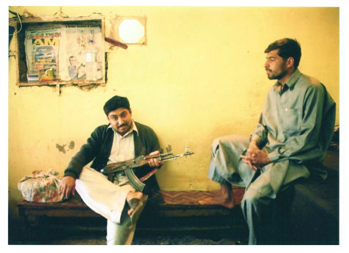
The prevalence of the gun in everyday life of the local tribal culture

the word "savage" today, but how then does one describe the slaughter of thousands of Shia Muslims at the hands of the Taliban during the closing stages of their campaign to conquer Afghanistan? What are the proper (politically-correct) terms to be used when describing the deliberate, calculated and wanton slaughter, rape and torture of innocent civilians at the hands of their Taliban victors?