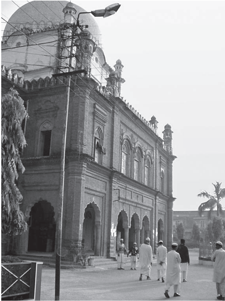
Figure 2. Dar al-Hadith, where prophetic traditions are being taught

international educational and political movement of purist Islam. Recent developments raised much speculation about the influence of the Deobandi educational movement and its role in the formation of international radical and militant Islamic thought. The reference of the Taliban rulers of Afghanistan to their Deobandi theological moorings contributed to this as much as the active role that the Pakistan-based religious parties wedded to the Deobandi school of thought, the two wings of the Jam'iyyat-e 'Ulama'-e Islam, played in the organization and support of militant religious opposition groups in Afghanistan, the mujahideen.