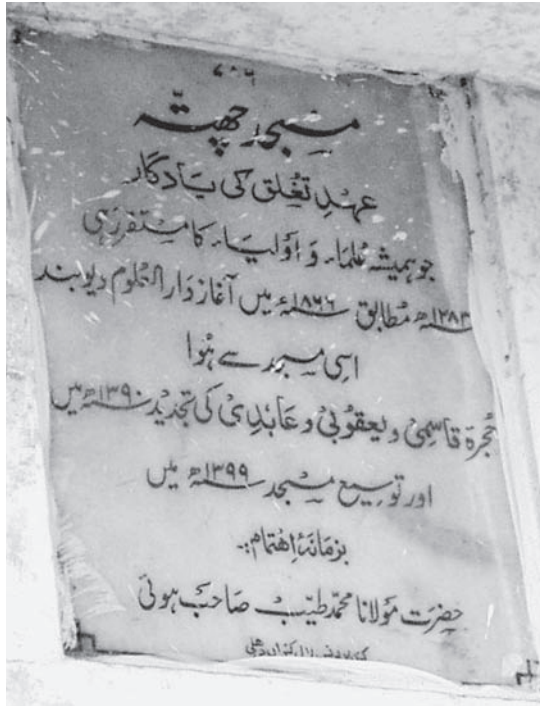
Figure 1. Inscription in Chhatta Mosque, where teaching started in 1866

impediment to the profession of true Islam not only in India but in the Islamic world at large. They particularly identified with Ottoman rule and mobilized against its defeat after World War I together with Mahatma Gandhi in the broad-based but unsuccessful Khilafat movement.