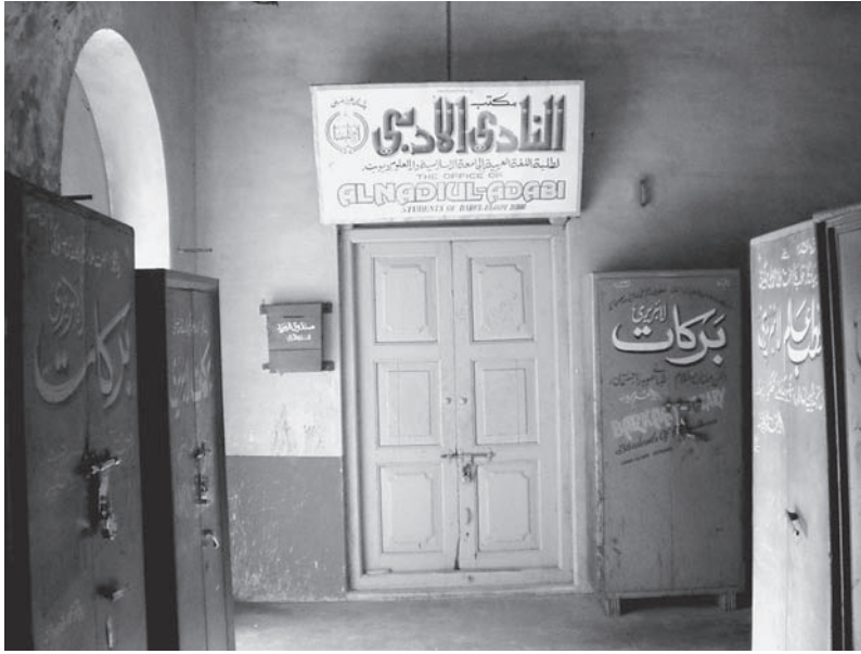
Figure 3. Office of the student organization ( anjuman ) for Arabic language and literature al-Nadi al-Adabi; bookshelves of various anjumans to the left and right