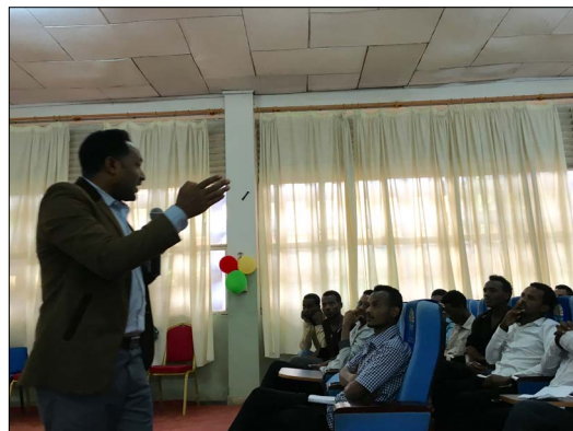
Entrepreneurship training in Ethiopia, 2016

versity graduates, for example, are strikingly similar to entrepreneurship courses during the 1960s that were part of »modern« leadership training in the Ethiopian Empire. Not very unlike the present, the courses were facilitated by international organisations at that time, especially the North American YMCA. What still remains is the question of whether the talk of entangled futures is intentional or is perhaps even concealing something? Is it, on the political level, an attempt to hide a new interest into speculative investments in areas such as resource extraction or infrastructure, which require stable political environments? After the rollback of the state through structural adjustment programmes, this obsession with entangled futures promotes the return of the state; i.e. stable governments and good governance. A great deal of money has been therefore channelled into capacity building in the armed forces or administrations. One