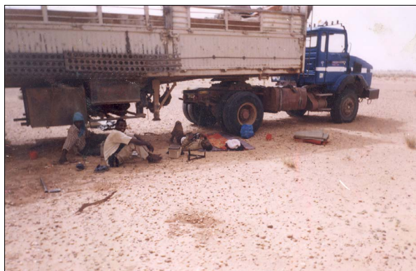
Trans-Saharan Truck in Northern Mali, 2008

The video went viral; its author was feted as a heroine; demonstrators took to the streets in various European and sub-Saharan African capitals; related matters were debated at the UN security council. Few inquiries were made, however, into the »slavery« that had been por-