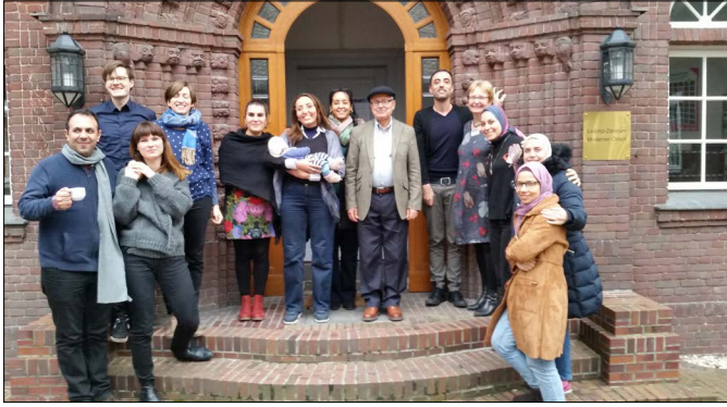
The participants in front of the ZMO entrance