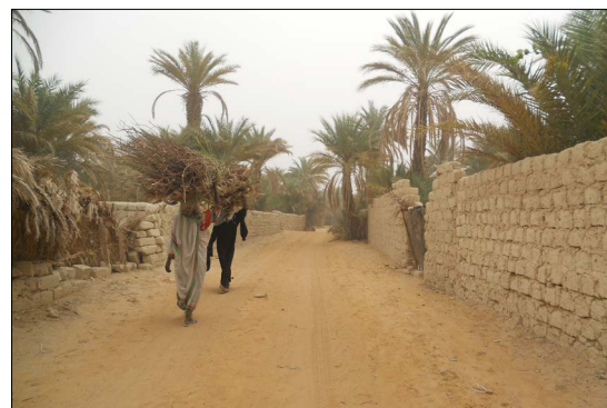
Faya palm-grove, Northern Chad, 2012

Having carried out long-term ethnographic fieldwork in a number of different Saharan field-sites – in Algeria, Mali and Chad – since 2007, my research project at the ZMO aims to pull my prior findings together, to enrich them with a careful study of local archival materials and secondary sources produced on other areas in the Sahara, and, ultimately,