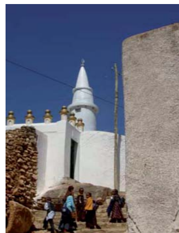
Mosque »Din Agobara«, Harar, Ethiopia

The aim of this workshop was to explore the questions of how recent socio-political dynamics have shaped new patterns of integration and translocal entanglements, while at the same time contributing to new practices of boundary making. Such reciprocal and dynamic processes explain how new trajectories of communications may trigger old as well as possible new lines of conflict. In general, the event challenged the popular notion of a primarily »Christian Ethiopia«. The workshop was organized in three sections of different analytical scale: a) Ethiopian Muslims in the