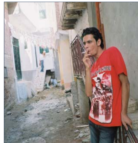
A young man with a Che Guevara T-shirt in northern Egypt

ond step, the dissertation seeks to examine the extent to which Ottoman travellers deemed themselves able to learn something from these new Balkan states about their perceived progress towards the standards of metropolitan Europe. Therefore, the goal is to shed light on the networks of relations among the Ottoman Empire, the Balkans and Europe and to clarify the Ottomans' self-location within this newly established arrangement.