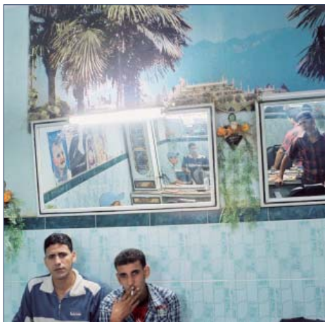
A barber shop in a village in northern Egypt