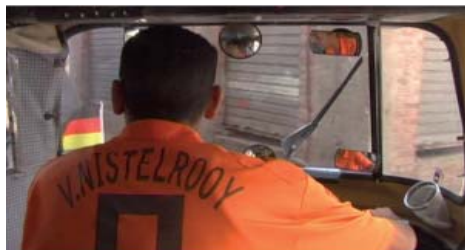
Toktok driver in northern Egypt with German flags and a Dutch jersey. Video still from »Messages from Paradise #1« by Daniela Swarowsky and Samuli Schielke, 2009

parts of the two opposing blocs (socialism versus capitalism) during this period play in the formulation of Islam as a distinct political system and an alternative to those societal models? Further, what were the political and economic conditions of production of the Arabic-language media of these debates, and how were they connected with other local, national or transregional media (books, radio, television)?