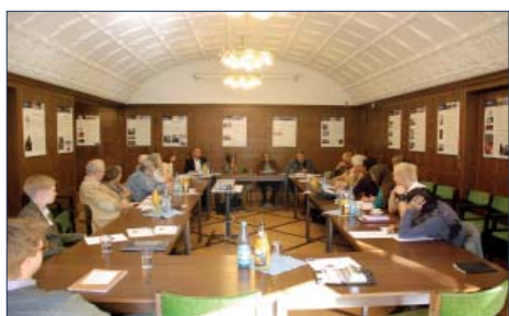
Participants of the colloquium at ZMO