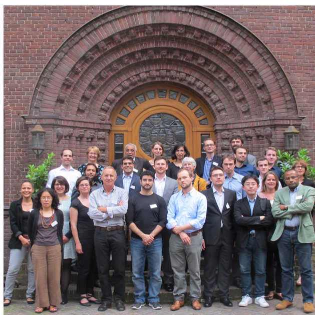
Group photograph in front of ZMO's main entrance, 13 June 2013

The wealth of presentations and the diversity of topics and approaches treated during the three days of the workshop received very positive feedback from participants and visitors. Further workshops might nevertheless limit the scope of topics, providing more time for each section and research field, thereby giving participants more space for self-exploration and discussion. The strong resonance showed that research on Saudi Arabia is evolving fast. Particularly in disciplines such as history, Islamic studies and anthropology, which traditionally excluded the kingdom, there appears to be strong interest in research from the region. The topical, methodological and scholarly interdisciplinarity of emerging scholar-