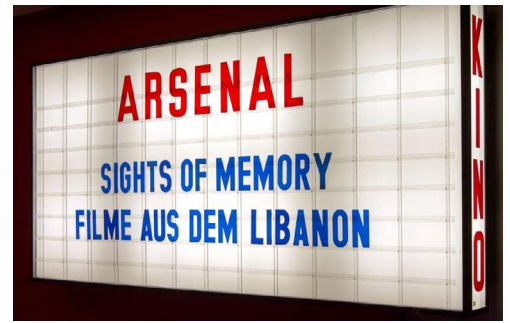
Entrance to the film programme at cinema Arsenal