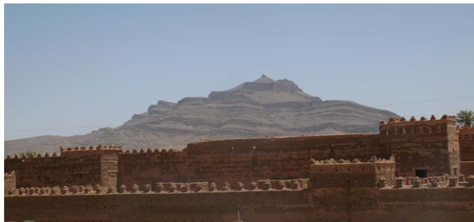
View of Agdez Prison from the cemetery, April 2013