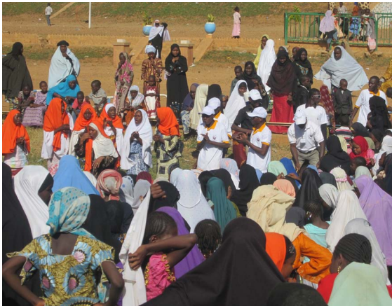
Group of young people at a Wazu, Niamey 2012

I studied Philosophy, Sociology and Anthropology in Niger. Later I continued my studies in Dakar, and then won a Fulbright scholarship to study in the US. I decided to go to Arizona State University, where I got a MA in Religious Studies. And then, when I wanted to get a PhD, I transferred to Northwestern University, because of their interest and resources in African Studies. I was affiliated with Anthropology and Religious Studies. I completed my PhD in June 2012 and my dissertation is an ethnography of sermon practices within the context of the Izala Islamic reform in Niger.